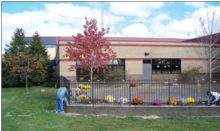
Work began on the Children's Garden at the end of last summer. Come to the dedication to see the beautiful finished project!