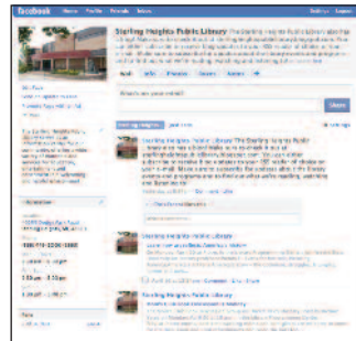
Left, the Sterling Heights Public Library on Facebook; right, the Sterling Heights Public Library's new blog.

In the case of inclement weather, the dedication will be held in the Library Programming Center. If you would like to attend, please RSVP by calling (586) 446-2640.